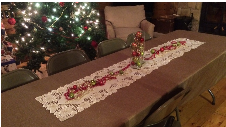
The decorations are ready! And now we wait.