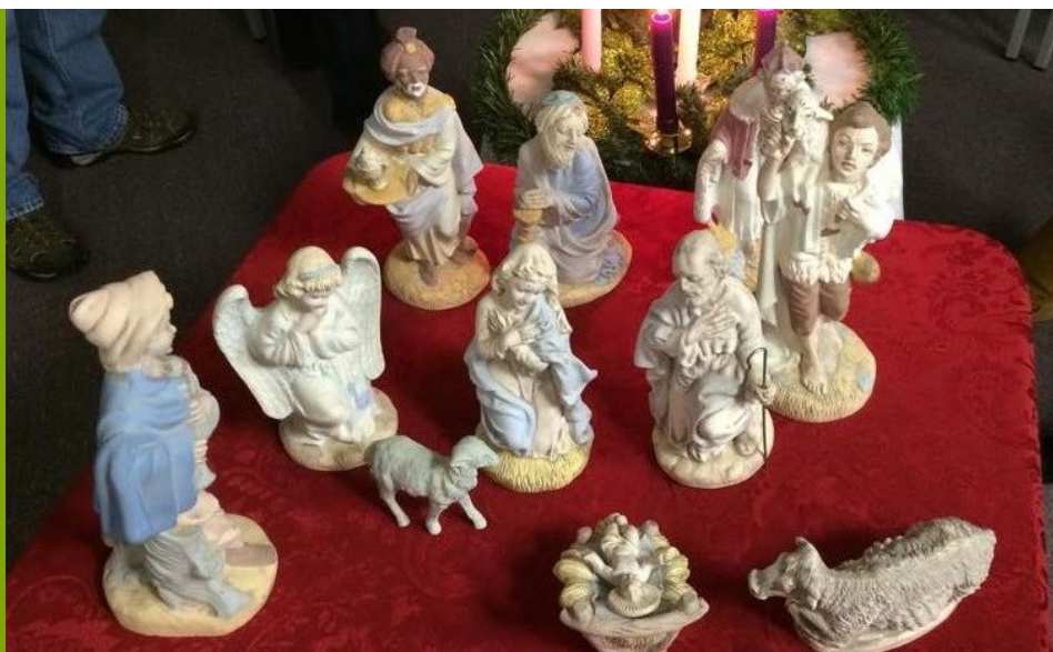
Christmas Eve Service, 2015

We also hope to keep adding features to our website for regular attenders. This is another way we can stay connected during the week if we miss a Sunday!